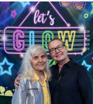
Angels celebrating the 2024 Prom