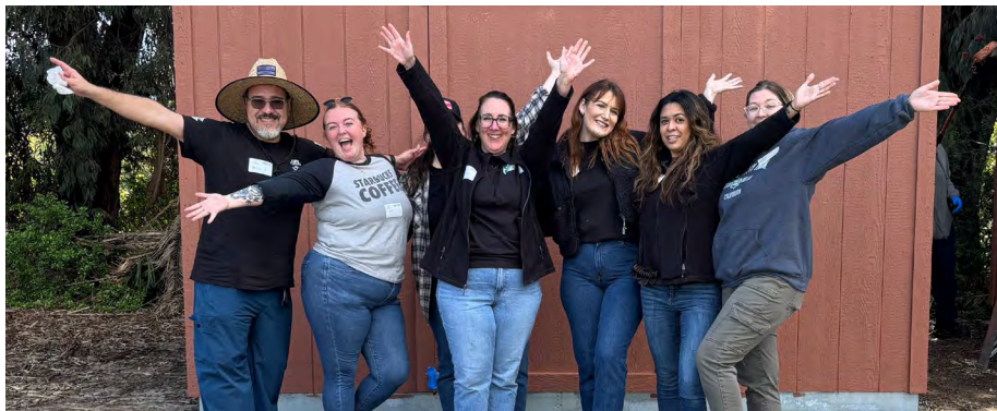
Starbucks volunteers giving our campus some TLC!

Throughout the year, our Casa Pacifica family finds unique and meaningful ways to support our youth. We appreciate all of these efforts – big and small – which help fulfill our mission of building bright futures for at-risk children, young adults and families.