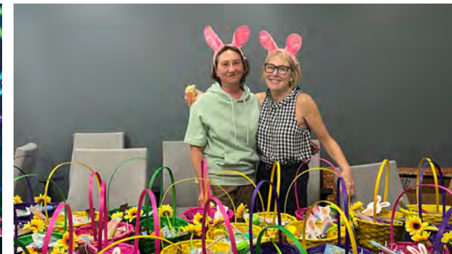
Volunteer Angels filling Easter Baskets