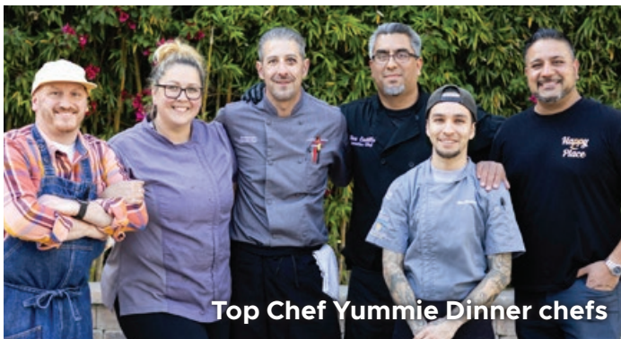
Top Chef Yummie Dinner chefs