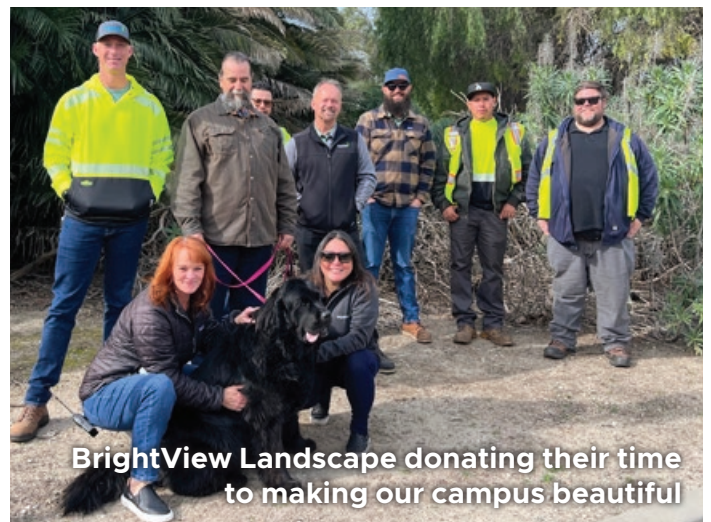
BrightView Landscape donating their time to making our campus beautiful

T hroughout the year, our Casa Pacifica family finds unique and meaningful ways to support our youth. We appreciate all of these efforts – big and small – which ultimately help us carry out our mission of building bright futures for at-risk children, families and young adults.