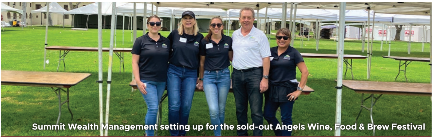
Summit Wealth Management setting up for the sold-out Angels Wine, Food & Brew Festival