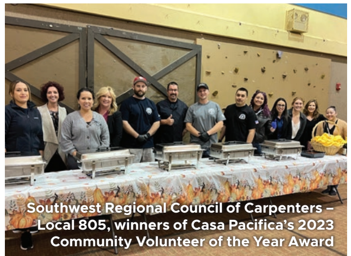
Southwest Regional Council of Carpenters – Local 805, winners of Casa Pacifica's 2023 Community Volunteer of the Year Award