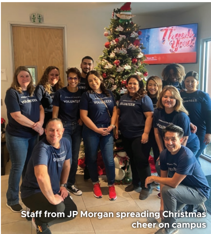
Staff from JP Morgan spreading Christmas cheer on campus